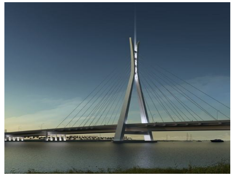
Conceptual design of Lekki-Ikoyi Bridge

From a contracting perspective, the definition of 'Concessions' is fairly narrow as it focuses on elements of the build, finance, operate and transfer model of PPPs without including other